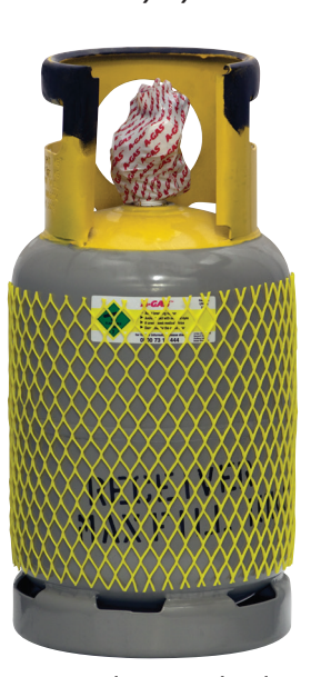
Pump down cylinder